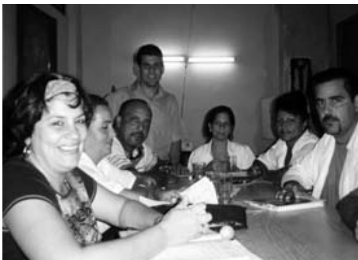
Cuban workers meeting to plan reconstruction after the hurricanes.

Cuba's Gross Domestic Product fell by 40 per cent and it experienced shortages of every kind of product that it previously imported from the Soviet Union